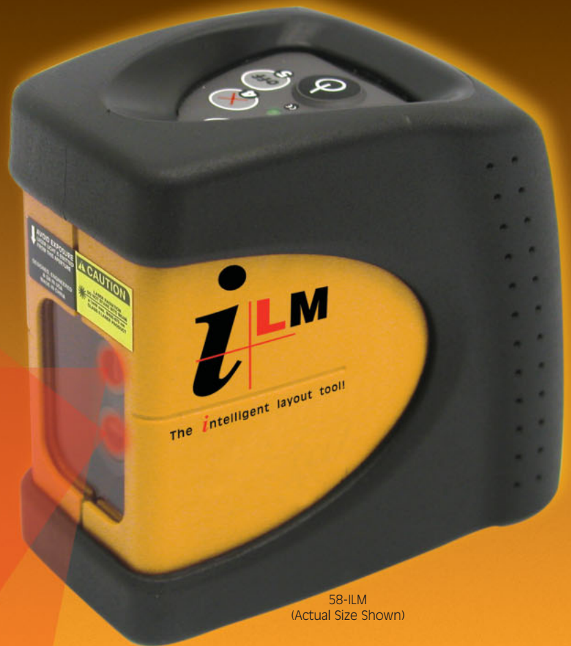
58-ILM (Actual Size Shown)

Projects bright, self-leveling level and plumb laser "chalk lines" for instant, accurate reference marks